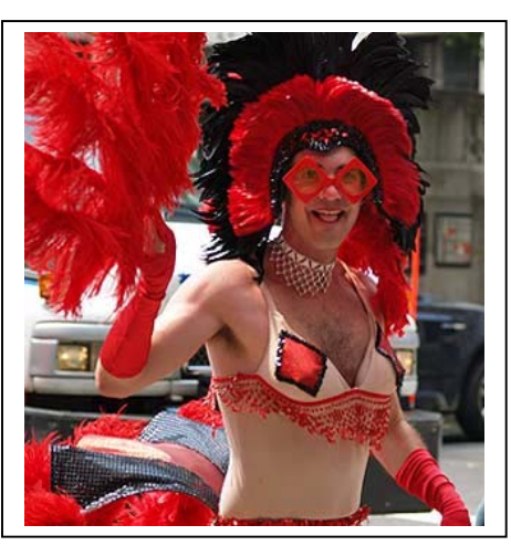
Man marching down Tremont Street