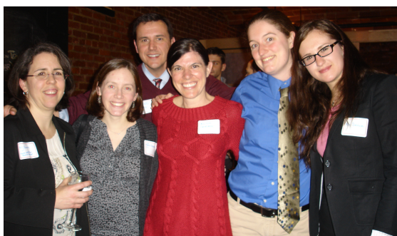
Committee on Transgender Inclusion Winter Party.

To see more upcoming events, as well as career and volunteer opportunities, visit us online at www.masslgbtqbar.org . We also now have a Facebook fan page – Massachusetts Lgbtq Bar Association. Check it out and “like” us!