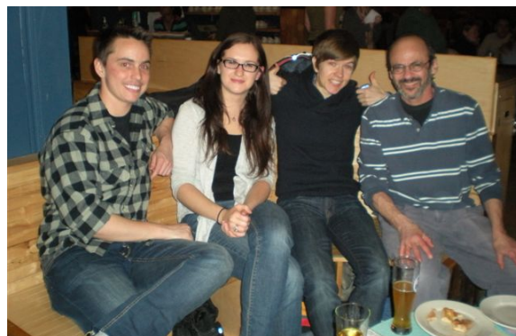
Mass LGBTQ Bar members at the March 2011 bowling event.

If you are a Mentoring Program participant, please save the date for a party to celebrate the conclusion of the mentoring program year. Details to follow.