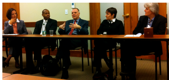
Coming Out in the Workplace panel at the BBA.