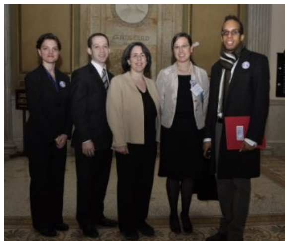
Mass LGBTQ Bar members at the Walk to the Hill for Legal Aid.