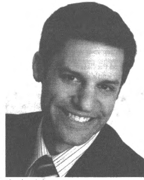
Stephen A. Paparo

This report reveals that schools are not necessarily safe learning environments that allow young people to achieve their potential as students and future adults. As a teacher-educator, I believe that public schools have a responsibility to serve all students, regardless of their sexual or gender identity. The findings of the report suggest that administrators, teachers, parents,