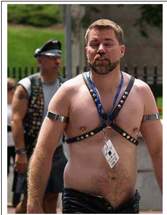
Man with nipple rings marching past State House with sado-masochism group!