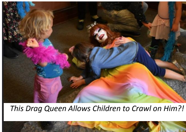
This Drag Queen Allows Children to Crawl on Him?!