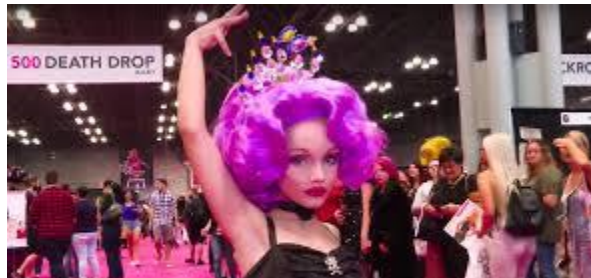
Kids indoctrinated into drag!

Drag performer admits that the whole programs is targeting and grooming innocent children!