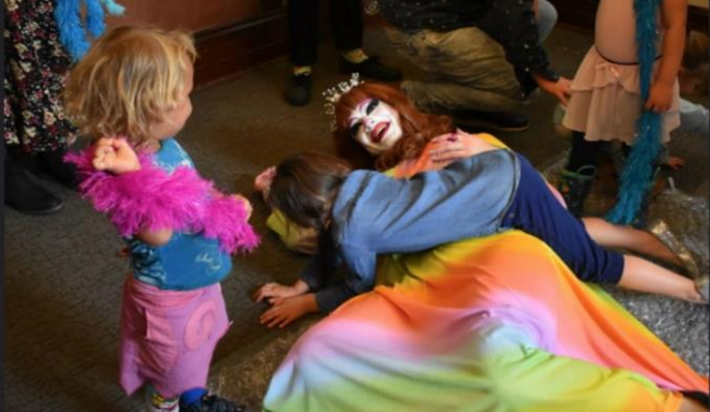
This Drag Queen Allows Children to Crawl on Him?!