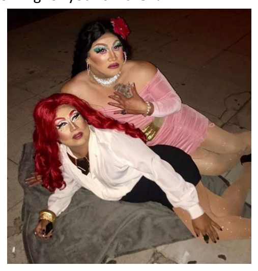
Drag Queens "Barbie Q" and "Raquelita" -- Should these men be reading to your children?

"Drag queens" – men dressed as flamboyant women – are mostly practicing homosexuals. They also suffer from "gender identity" confusion, but they celebrate this insanity.