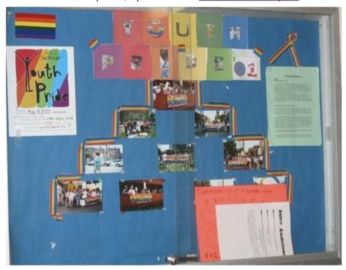
GSA bulletin board from Acton-Boxborough High School encouraging students to attend Youth Pride 2001. Photo was posted on PFLAG-Boston's website.

The infamous <u>GLSEN-Boston conferences</u> (where teachers received "professional development credits") – including the infamous "<u>Fistgate</u>" – fit this bill. Suicide prevention falls under this recommendation, though is not elaborated on. While teachers and counselors will learn "about health problems of gay and lesbian youth," only "emotional and physical problems" and suicide are mentioned – nothing on their higher risk for HIV/AIDS, STDs, or drug abuse, or depression due to other causes. (pp. 32-33) Would teachers and counselors be instructed not to share certain information with a child's parents (if spoken in a school "Safe Zone" or "Safe Space")?<sup>42</sup>